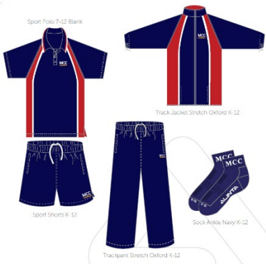
Sport Polo 7-12 Blank